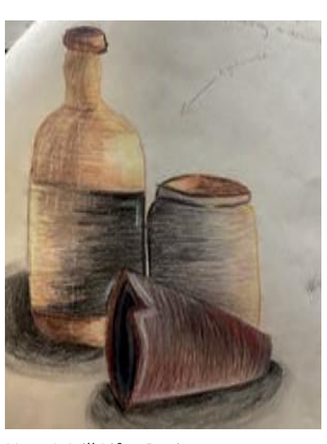
Year 8 Still Life - Project Assessment Work