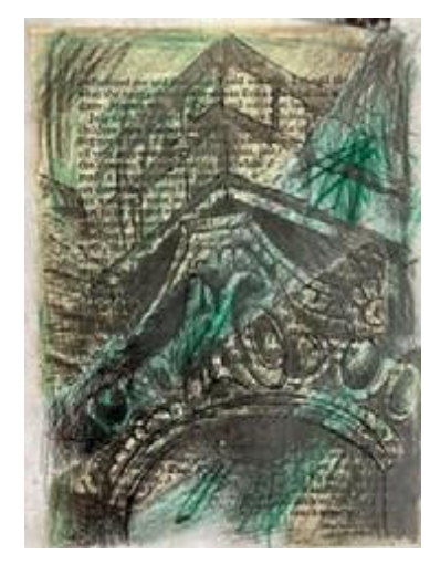
Year 9 Architecture Project Mixed Media Study