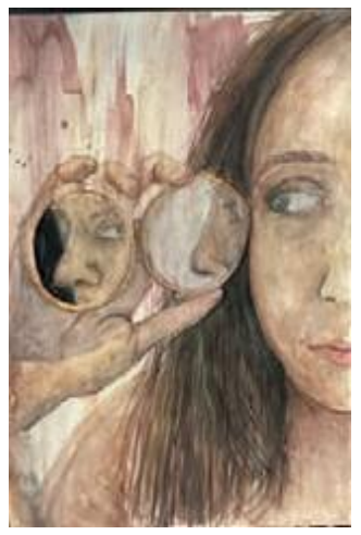
Year 11 GCSE Coursework 'Reflections Research Drawings