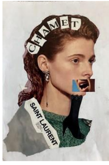
Year 9 Portrait Project -Surreal Collage