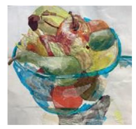
Year 11 Mixed Media Collage