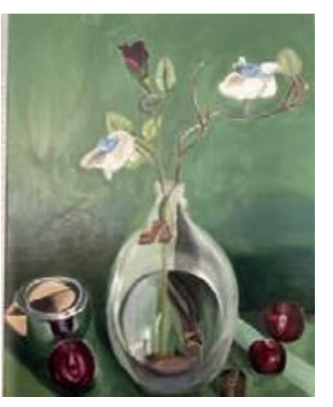
Year 11 Exam Final Piece Painting