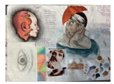
Year 9 Project Portrait -Project Sheet