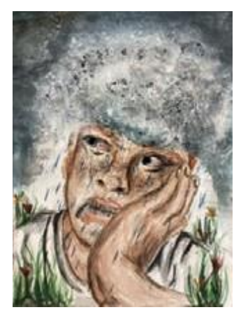
Year 9 Portraiture Project Assessment Piece