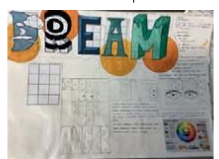
Year 9 Messages - Project Sheet