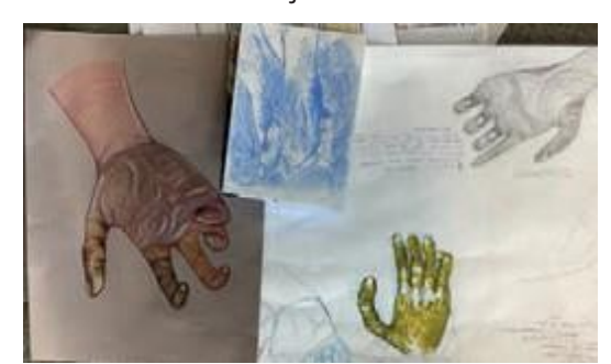
Year 8 Hands Development Drawings