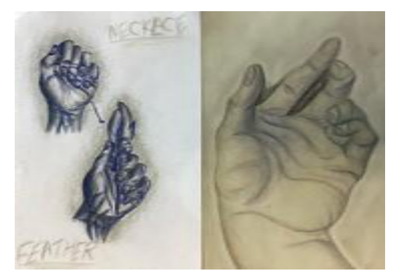
Year 8 Hands Project - Summative Assessment Sheet