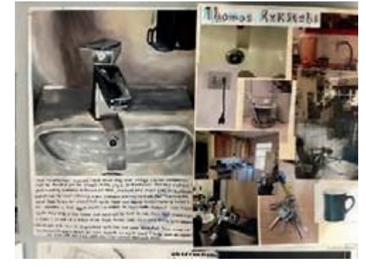
GCSE Coursework - Development Sheet