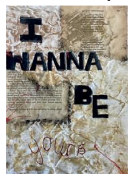
Year 9 Messages Project Assessment Piece